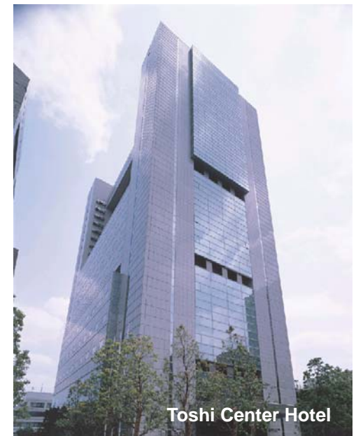
Toshi Center Hotel

The symposium will be held at Toshi Center Hotel which is adjacent to the Imperial Palace in the heart of Tokyo.