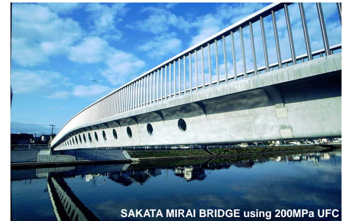
SAKATA MIRAI BRIDGE using 200MPa UFC